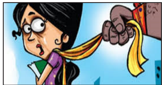
Fig 11.4.1 Sexual harassment