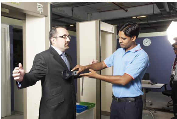
Fig 1.2.1 Frisking