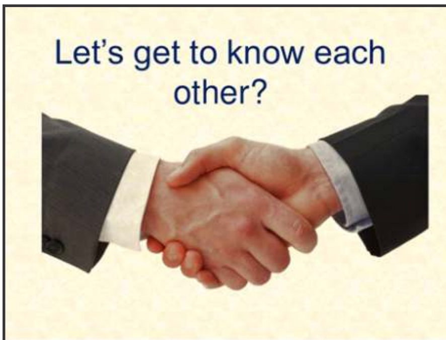
Fig-PG-001 Representative Image