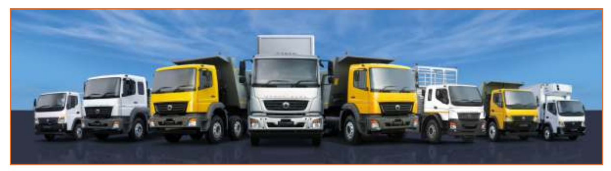
Fig 1.2.1 Typical Commercial Vehicle Set in India