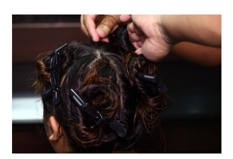
Fig. 1.1.1 Hair Services

The beauty and wellness sector is a growing sector in India. It has shown consistent growth in the last few years and has contributed significantly to the economic growth of the country. It has created huge employment opportunities across the country and can easily be termed as a leading employer. There are many factors which contribute to this phenomenal growth including rising consumerism globalisation and the changing lifestyle of the Indian consumer as well as an increasing rate of wellness tourism.