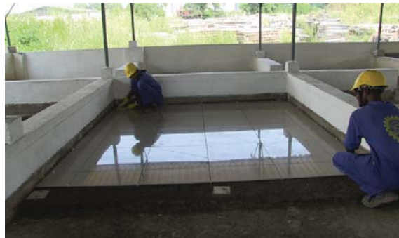
Fig 1.3.1: Placing tiles on the surface