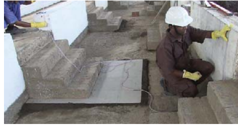
Fig 1.4.3: Marking as per level