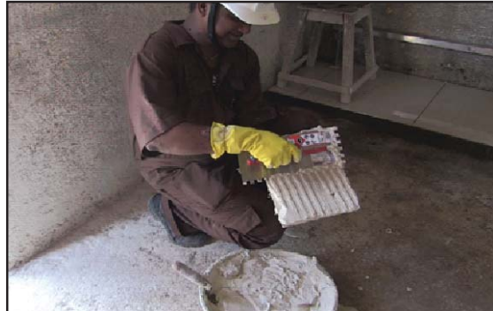
Fig 1.4.2: Practical session

The duration of training is around 400 Hrs including both classroom and practical sessions.