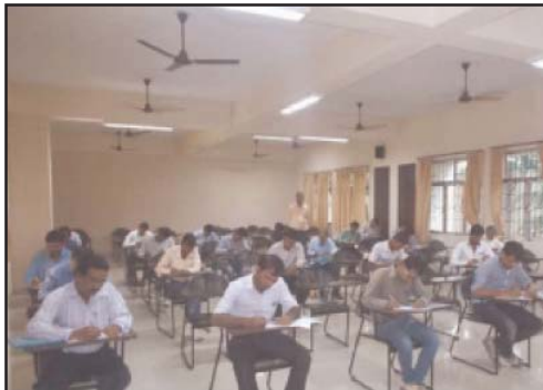
Fig 1.4.1: Classroom session