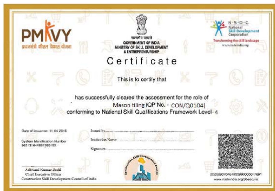
Fig 1.4.5: Skill certificate