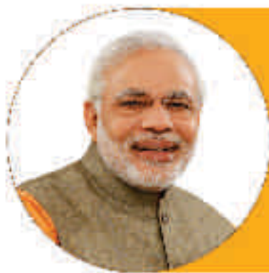
Shri Narendra Modi Prime Minister of India

“ Skilling is building a better India. If we have to move India towards development then Skill Development should be our mission. ”