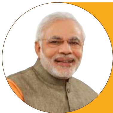
Shri Narendra Modi Prime Minister of India

“ Skilling is building a better India. If we have to move India towards development then Skill Development should be our mission. ”