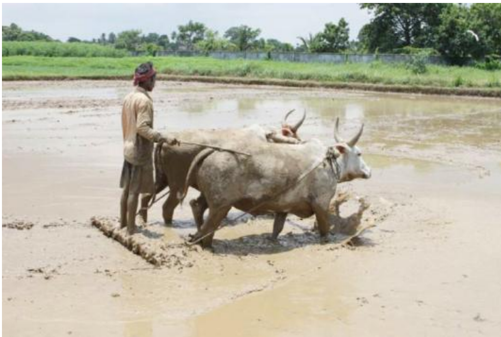
Fig 1.1.2 Land leveling in rice fields using draught animals

NB: You can refer Internet to learn more on contribution of livestock and poultry to Indian economy.