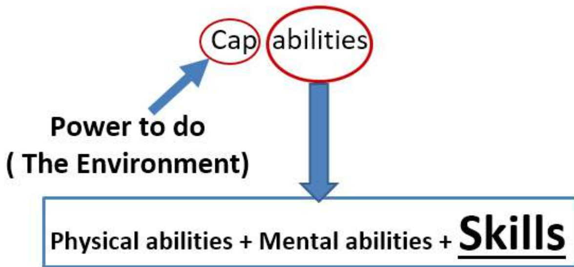
Fig 1.1.1 Understanding Capabilities (Note: Skill is an integral part of capabilities)

Capability of a person means 'capping' or powering the abilities of a person. Abilities includes physical abilities, mental abilities and skills. A person becomes capable of doing something only when he or she is able and there is proper environment or support e.g. Access to finance, access to market, road connectivity etc. Fig- 1 indicates various components of capabilities.