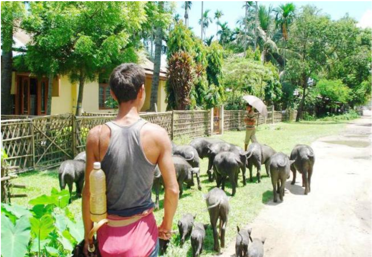
Fig 1.1.1 Rural Livelihood and Livestock farming

In simple word it is a way of earning money in order to live..