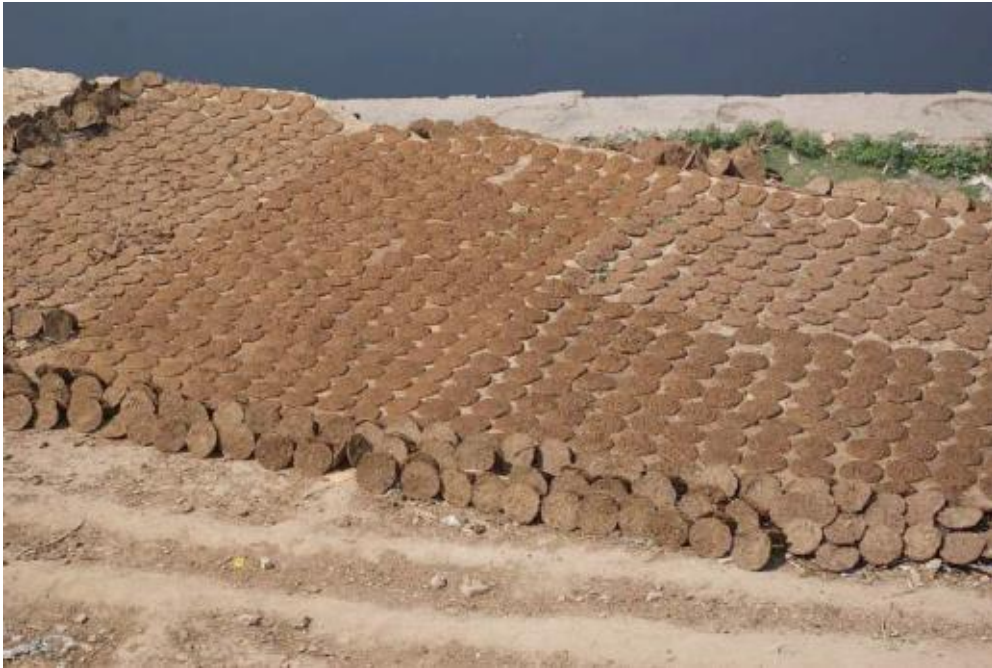
Fig 1.1.2 Cow dung cake used as fuel for cooking in Indian villages