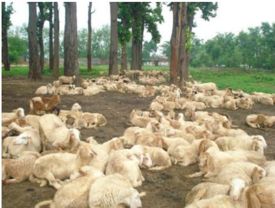
Fig 1.1.2 A herd of sheep near Indo-Nepal border

Livestock in India includes: Cattle, Buffalo, Sheep, Goat, Pig, Horses & Ponies, Mules, Donkeys, Camels, Rabbits, Mithun and Yak.