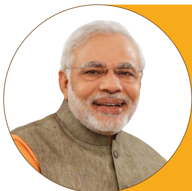
Shri Narendra Modi Prime Minister of India

“ Skilling is building a better India. If we have to move India towards development then Skill Development should be our mission. ”