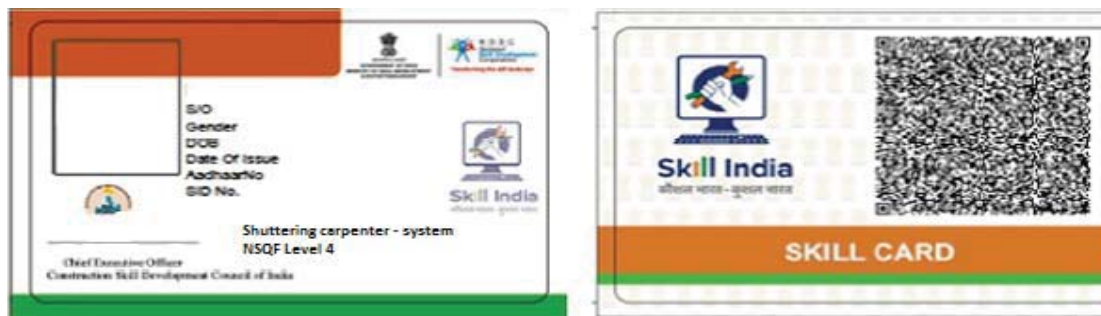
Fig 1.4.3: Skill card

After successful completion of training and passing the assessment you will be issued a certificate. This will facilitate you to get an employment as a Shuttering Carpenter – System in construction companies or independently. This certificate will help you to get job and earn better wages than an untrained person.