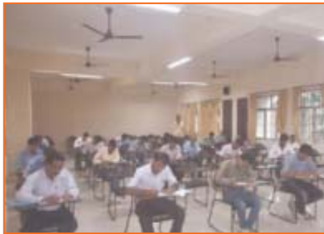
Fig 1.4.1: Classroom session