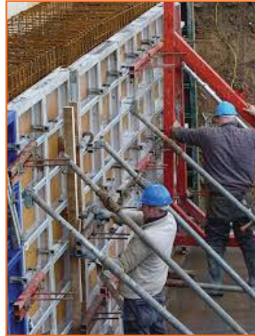
Fig 1.3.1: Shuttering work at site