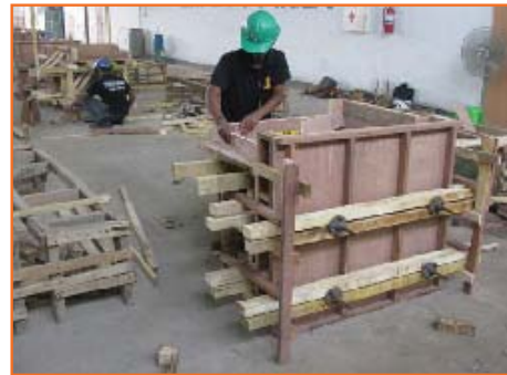
Fig 1.4.2: Practical session

The standard duration of this training program is 400 Hrs. of which 320 Hrs is devote to hands on training and the rest 80 Hrs on theoretical learning.