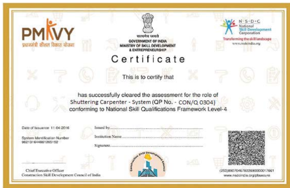
Fig 1.4.4: Skill certificate