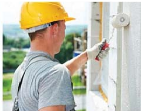
Fig 1.4.2: Practical session

The standard duration of this training program is 400 Hrs. of which 320 Hrs is devote to hands on training and the rest 80 Hrs on theoretical learning.