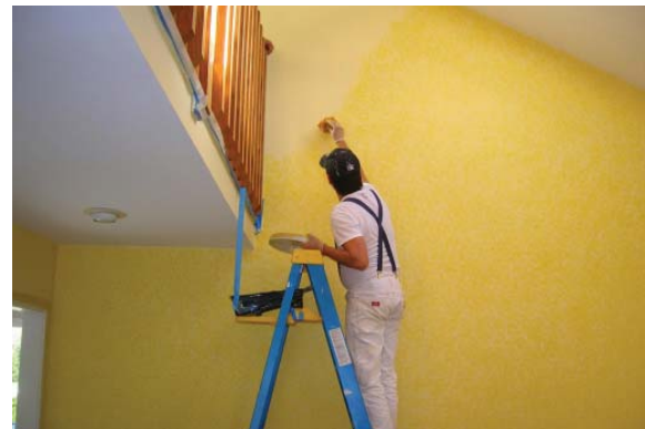
Fig 1.3.1: construction Painting