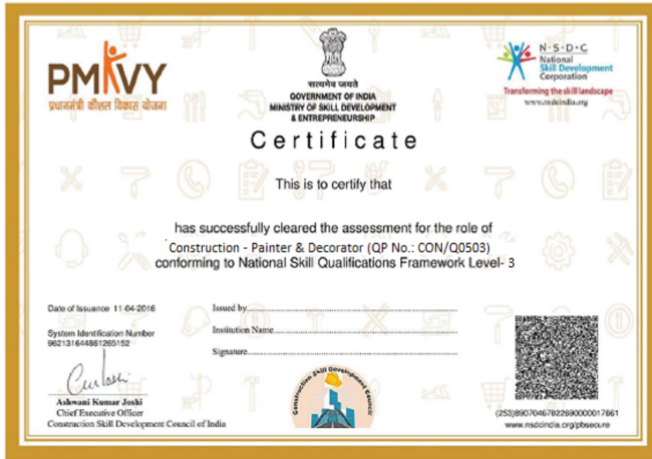
Fig 1.4.4: Simple certificate of Pointer & Decorator