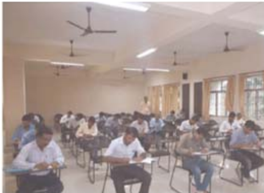
Fig 1.4.1: Classroom session