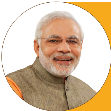
Shri Narendra Modi Prime Minister of India

“ Skilling is building a better India. If we have to move India towards development then Skill Development should be our mission. ”