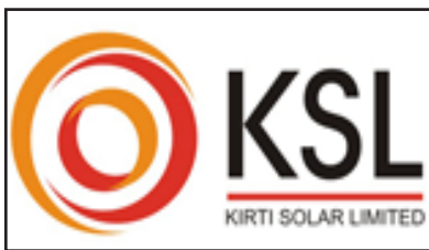
Kirti Solar Limited