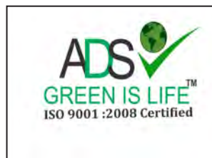
ADS Projects & Systems Pvt Ltd