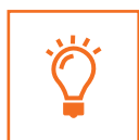
Key Learning Outcomes