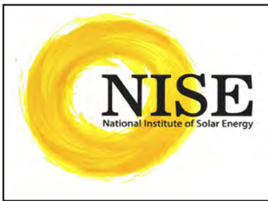
National Institute of Solar Energy